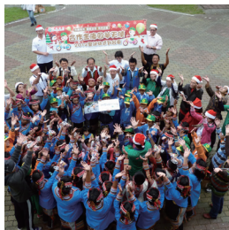
台灣合作金庫送出200台腳踏車為台東3所國小圓夢。 Taiwan Cooperative Bank delivered 200 bicycles to fulfilled dreams for 3 elementary schools.