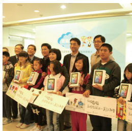
信望愛文教基金會奉獻330台平板電腦推動台東14所學校數位教學進程。 Faith, Hope, and Love culture & education foundation donated 330 tablet computers to facilitate digital education programs for 14 schools.