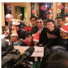
南區哈雷雲野鶴車隊滿足霧鹿國小吃牛排的願望。 South region Harley YunHe fleet sponsored the wish to eat steaks for WuLu elementary school.